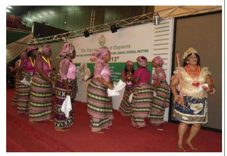
NSE PH Branch Spouses performing on stage during the Cultural Nite that was held on Wednesday 11th December 2013.