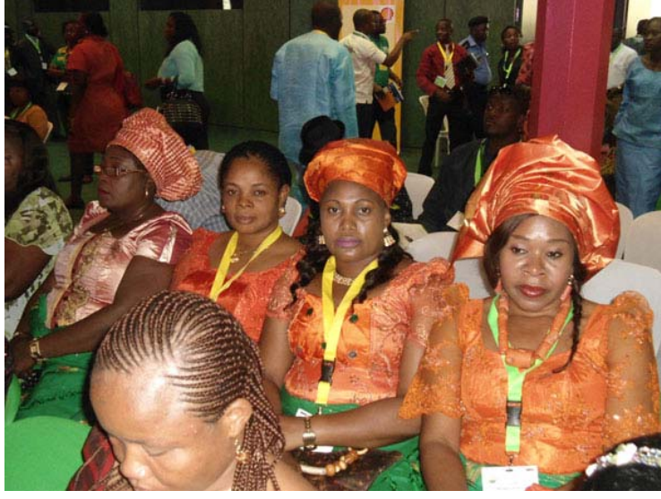
Some NSE PH Branch spouses at the Opening Ceremony of the conference on Tuesday 10th December 2013.